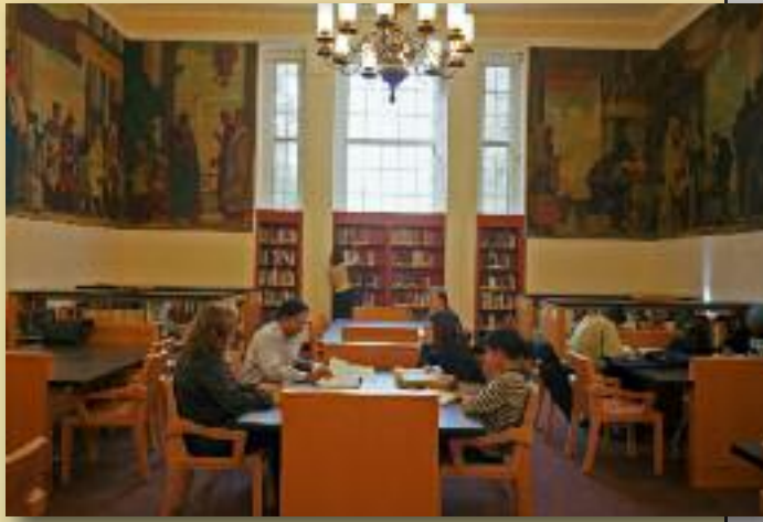
Brooklyn College Library

Bike Racks —safe places to lock up your bike are all around the campus. The College has provided them in highly visible locations at all entrances to the campus.