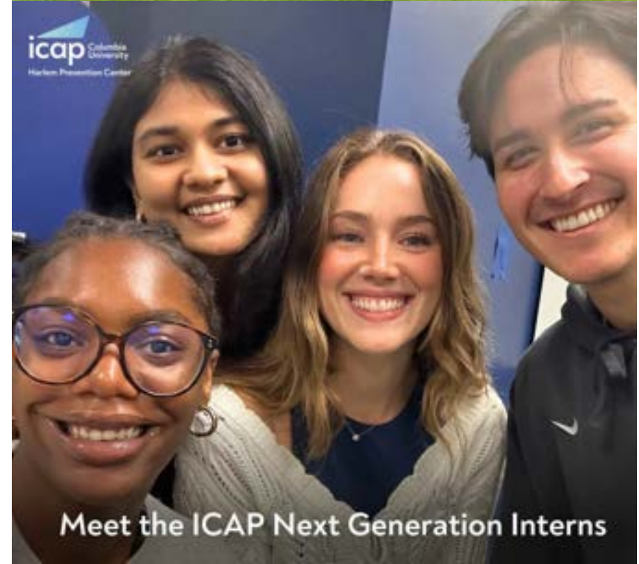
Meet the ICAP Next Generation Interns